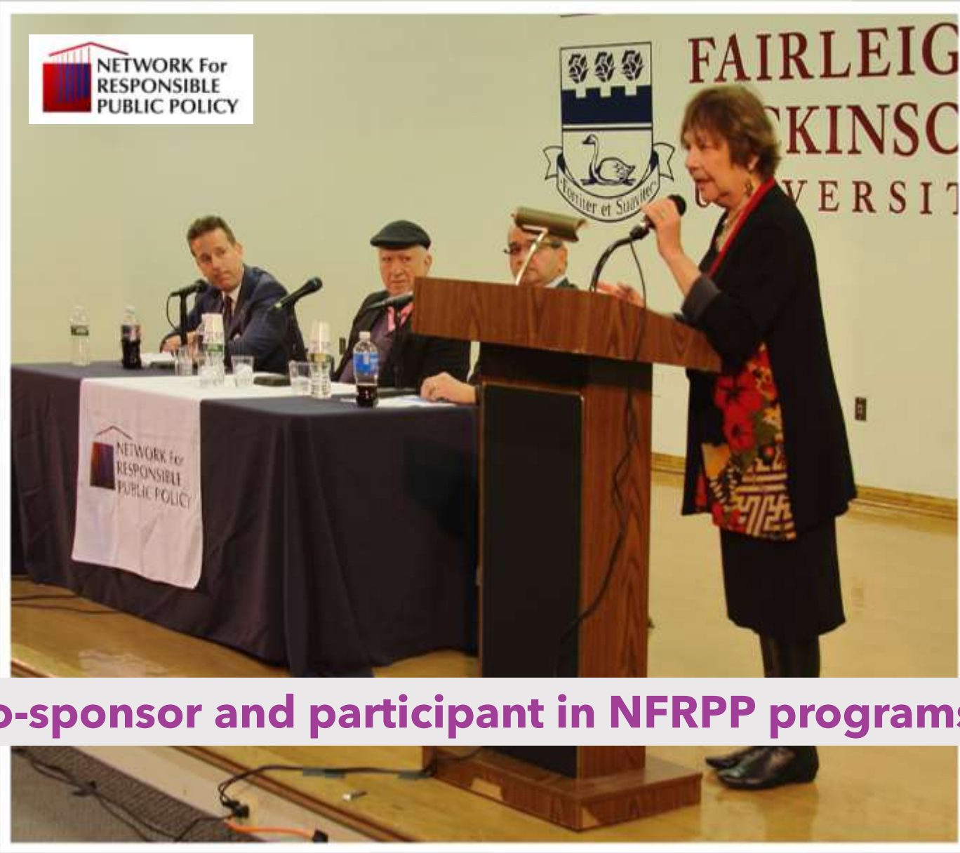
Co-sponsor and participant in NFRPP programs