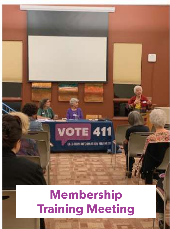
Membership Training Meeting