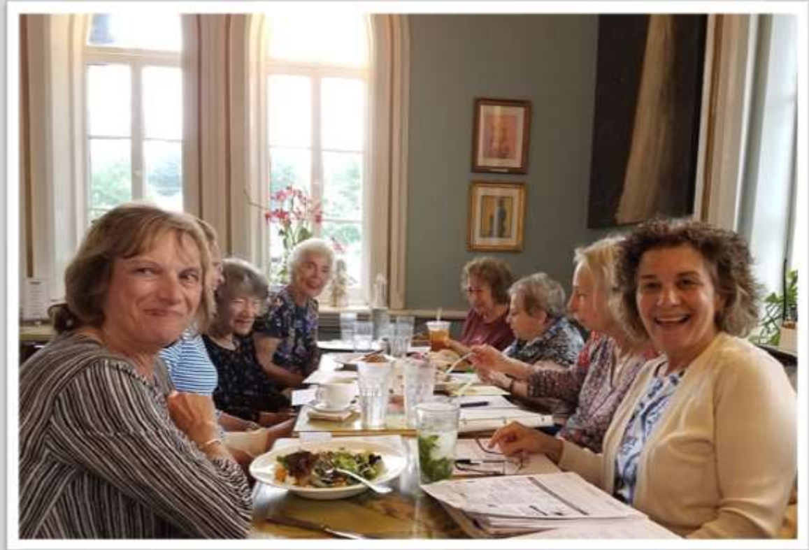
To A Board Meeting!